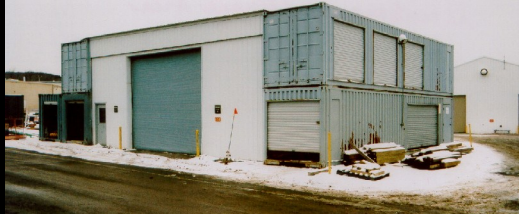
Maintenance Storage Area