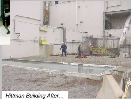
Hittman Building After...