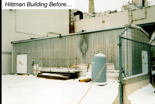
Hittman Building Before...