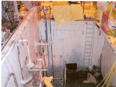
FRS Pump Pit