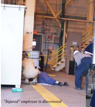
"Injured" employee is discovered