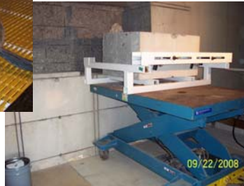
Below: Part of the wall is removed, leaving approximately one foot of concrete wall, which will be removed to install an access door