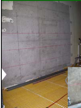
Above: External wall of the PPH is scored before cutting