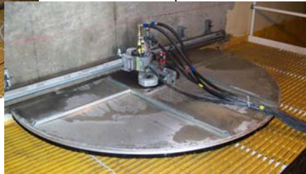
Above: Part of the wall is removed using a Track Saw, leaving approximately one foot of concrete wall, which will be removed to install an access door