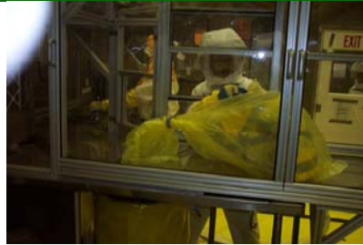
Above: Hood installed in Container Sorting and Packaging Facility Below: Off-site waste shipments resumed