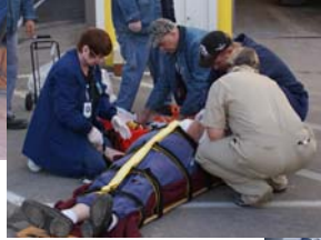
Left: "Injured" employee is placed on backboard, readied for transport Below: EMRT personnel are surveyed out after "injured" employee is transported to BCH