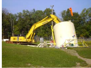
Above: Vit Diesel Shed demolition Below: Emergency Vehicle Shelter demolition