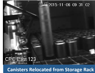
Canisters Relocated from Storage Rack