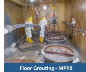
Floor Grouting - MPPB