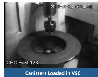
Canisters Loaded in VSC

Want the complete story check out the 1 st VSC relocation video: https://youtu.be/NdQdXlkdQjA