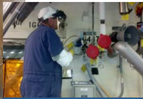
VIT Facility Demolition Preparations (Foam Penetrations)