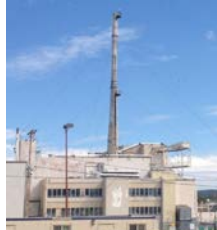
Main Building Process Plant