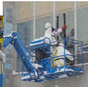
MPPB Demolition Preparations (MPPB Window Seal)