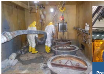
Grouting Activities in the Main Plant Process Building (MPPB)

As of March 10, CHBWV and subcontractors worked approximately 1,880,486 work hours (1,221 days) without a lost-time work accident or illness.