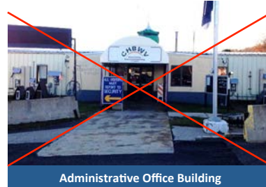
Administrative Office Building