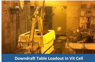
Downdraft Table Loadout in Vit Cell