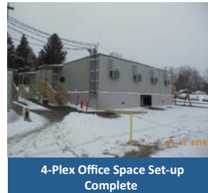
4-Plex Office Space Set-up Complete