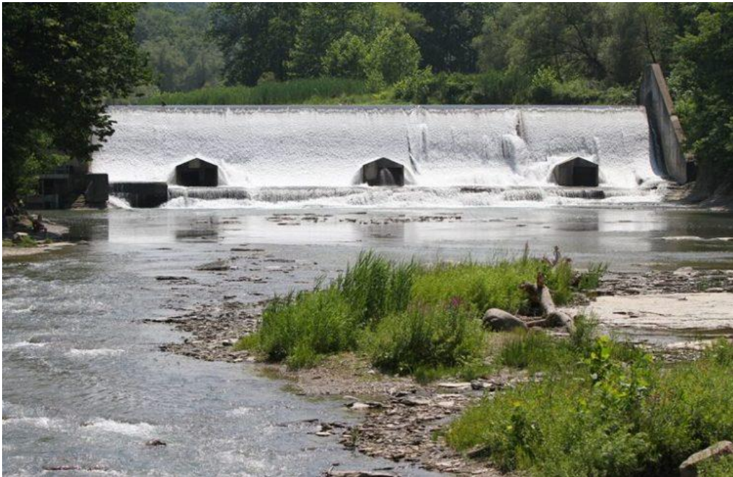
The U.S. Army Corps of Engineers has proposed lowering the Scoby Dam in Springville.

National Fuel's proposed Northern Access Pipeline is one. The pipeline cuts through the watershed. The DEC rejected plans for the pipeline earlier this month on grounds it didn't comply with water quality standards. The company is appealing.