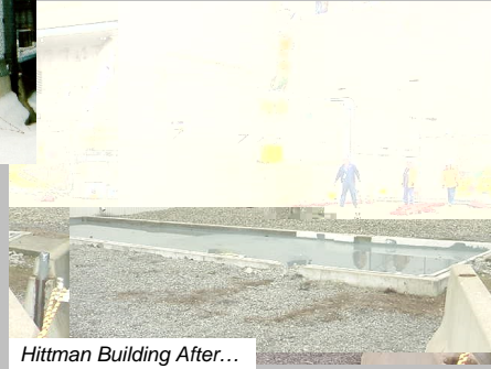
Hittman Building After...