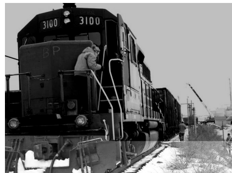
1 st train shipment made in March