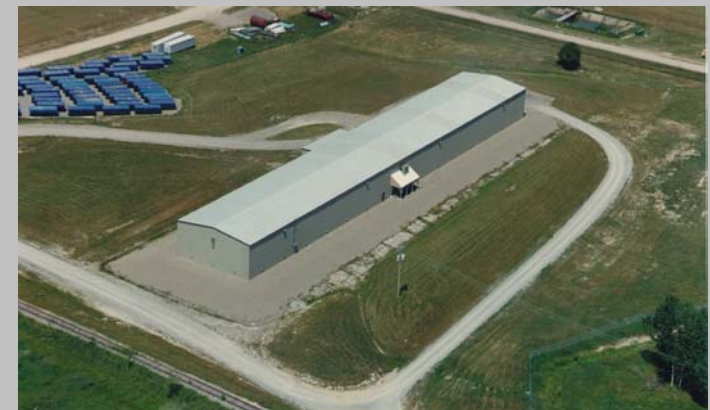
Aerial View of Drum Cell