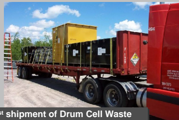
1 st shipment of Drum Cell Waste leaves the WVDP