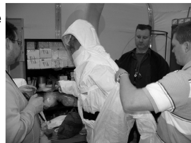
Training underway for use of new equipment