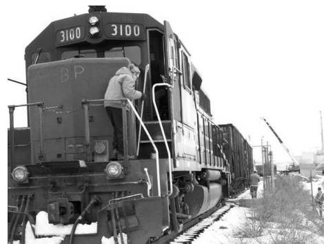
1 st train shipment made in March