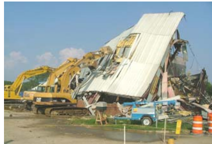
D&D and radiological free release, Columbus Closure Project, Ohio.