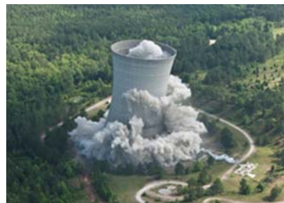
2010 Finalist, Demolition safety Award – D&Ri Magazine