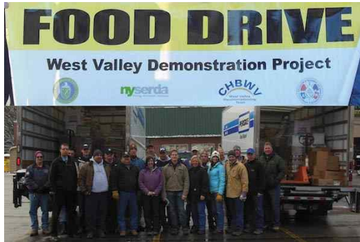
West Valley Demonstration Project employees volunteered to help distribute more than 125,000 pounds of food collected during their 2014 Food Drive.