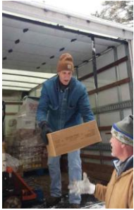
Food pantry volunteers accept donations from a WVDP employee.

Tuesday December 2, 2014 | By: Colleen Mahoney |