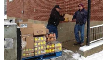
The Ellicottville Food Pantry was one of 1 of the recipients of donated food from the West Valley Demonstration Project's 2014 Food Drive.

WEST VALLEY— In its 25th year, the West Valley Demonstration Project's annual food drive collected more than 125,000 pounds of food, including almost 400 turkeys, to be delivered to nine area food pantries.