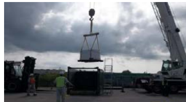
Loading LLW Shipment to Nevada National Security Site (NNSS)