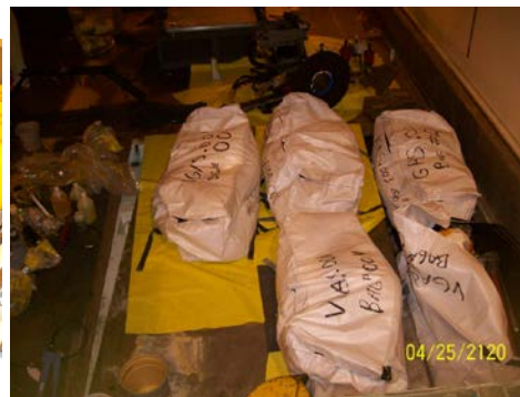
Vit CMR Cleanup (Before/After)