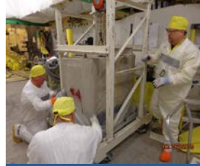
LWC Hatch Work