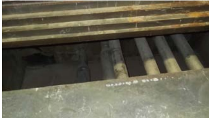
HLW Trench Shield Plate Removal