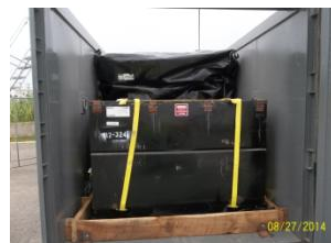
SR Box Shipment to NNSS