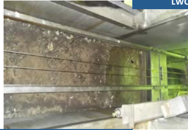
SSC Sample Transfer Trench Before and After Cleanout