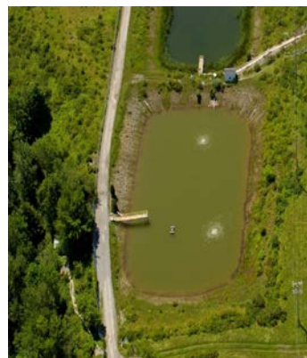
Aerial View of Lagoon 3