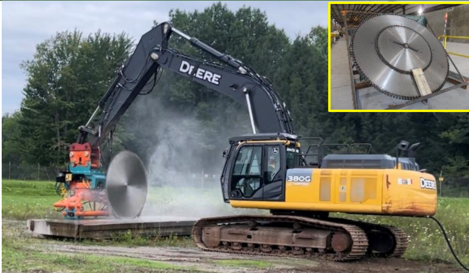
Quarry Saw Functional Test