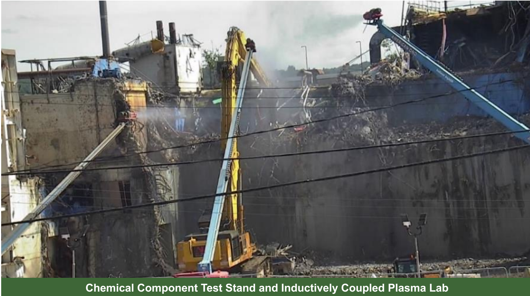
Chemical Component Test Stand and Inductively Coupled Plasma Lab