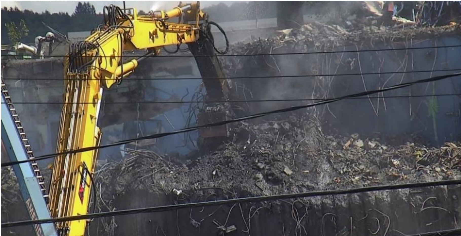
Sample Storage Cell Demolition and Shield Window Removal