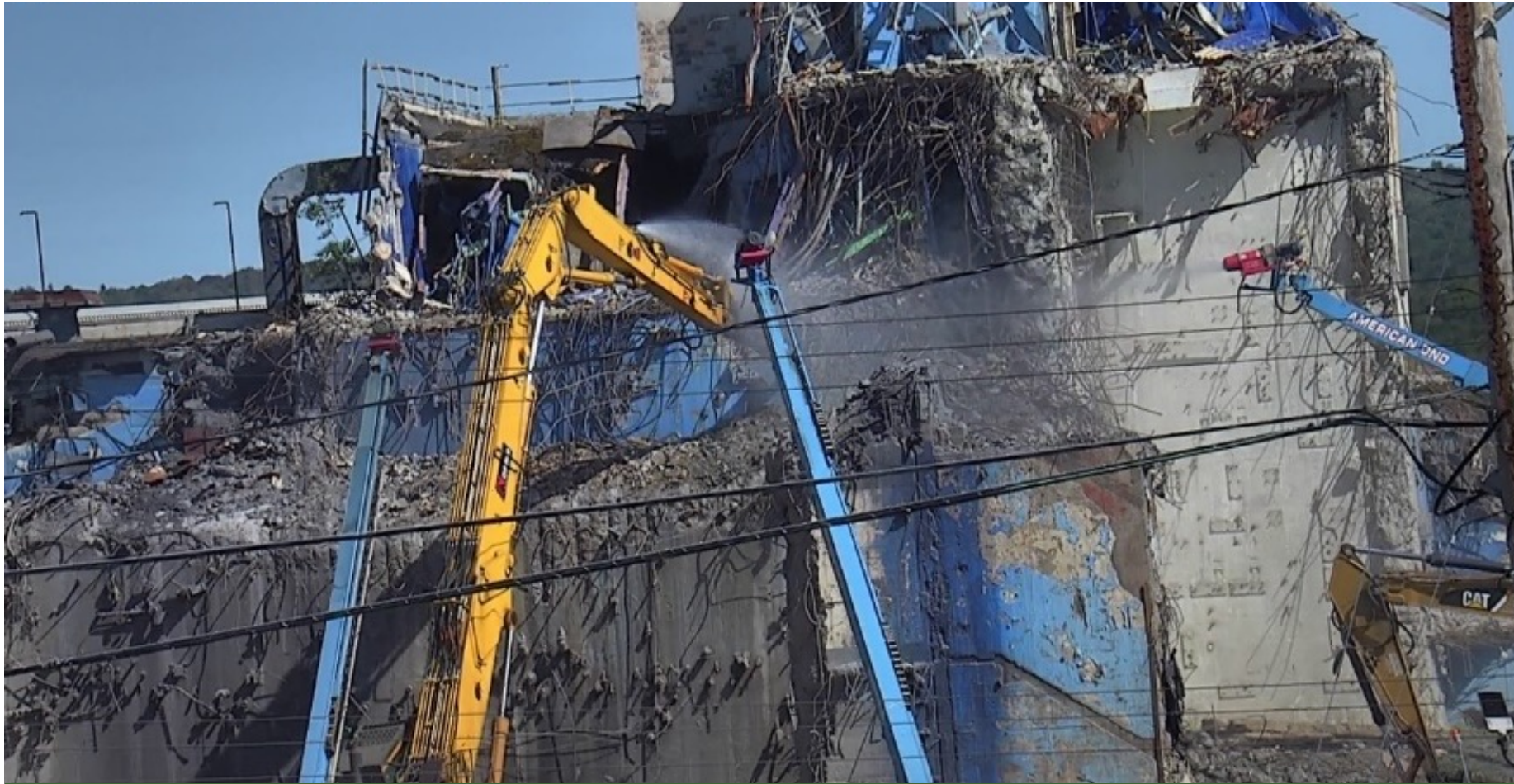
Hot Cell Demo & Shield Door Removal