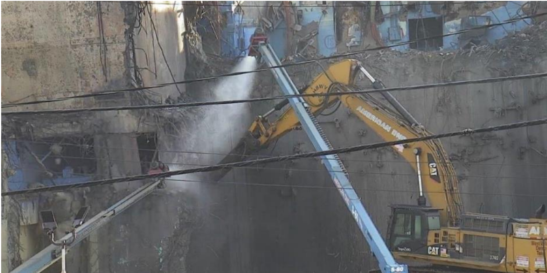
Deconstruction of the Chemical Process Cell North Wall