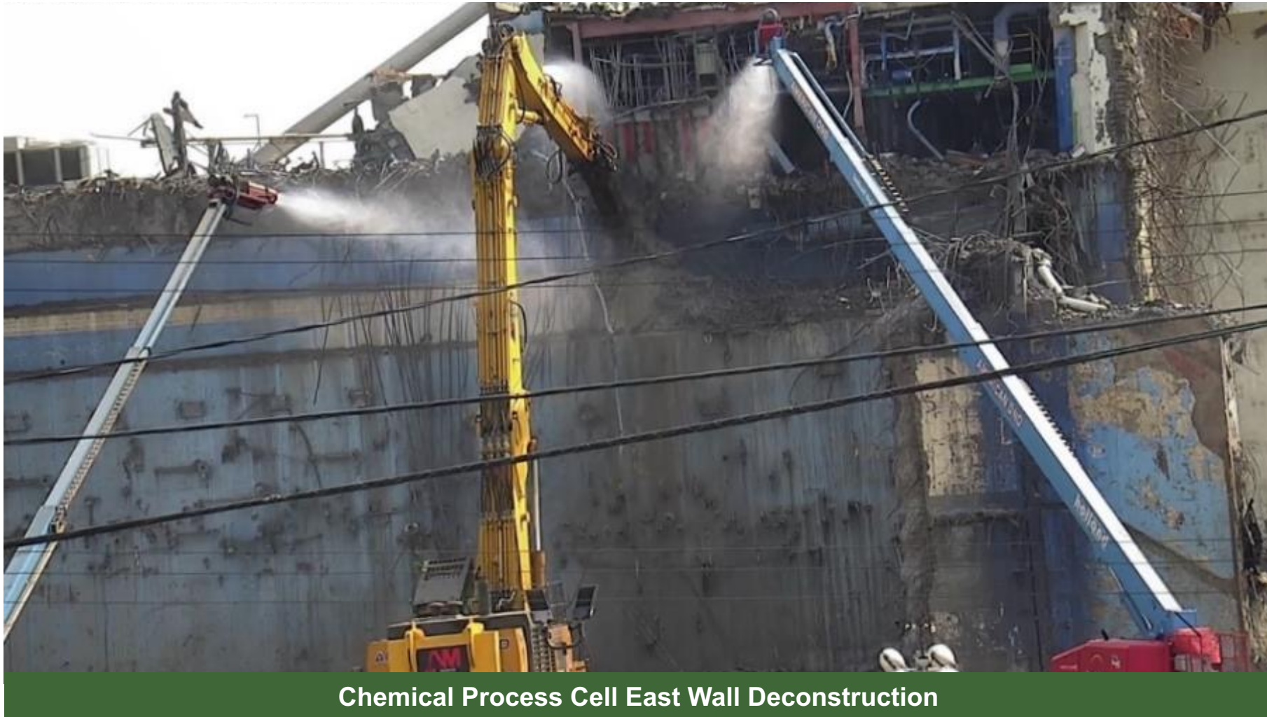
Chemical Process Cell East Wall Deconstruction