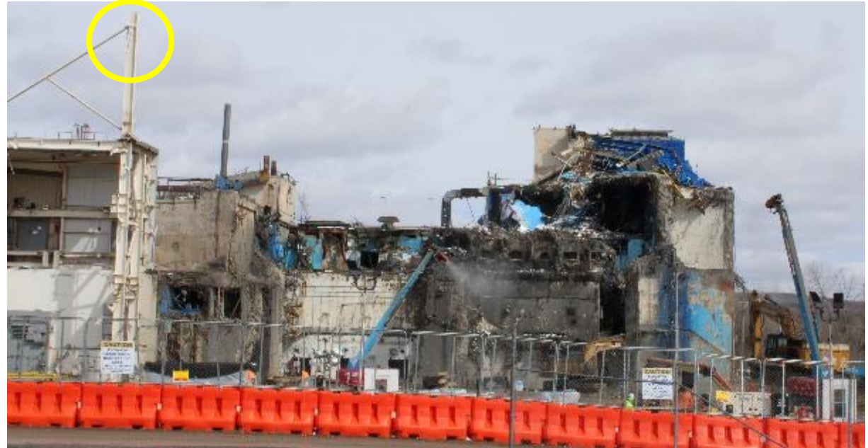
Main Plant west wall (March 2024)