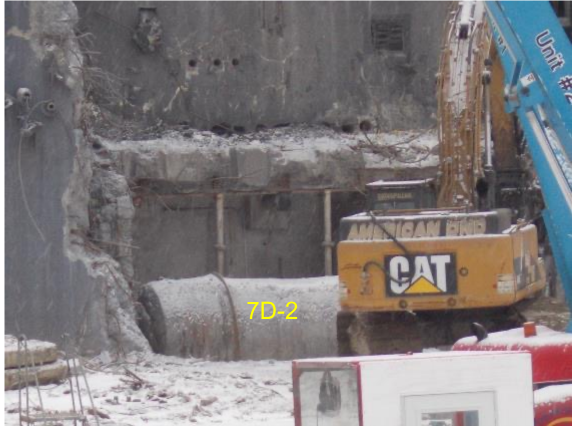
Liquid Waste Cell tank removal (7D-2)