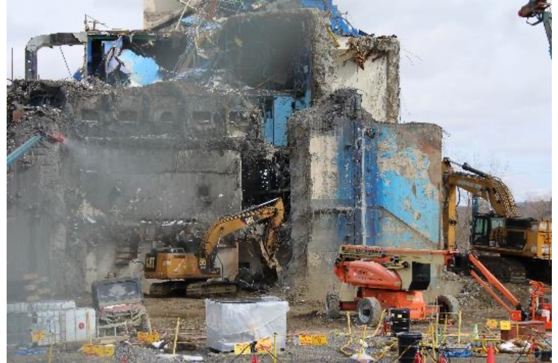
Waste loadout from the Deconstruction of Sample Cell #2