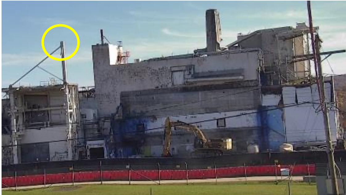
Main Plant west wall before deconstruction (June 2022)