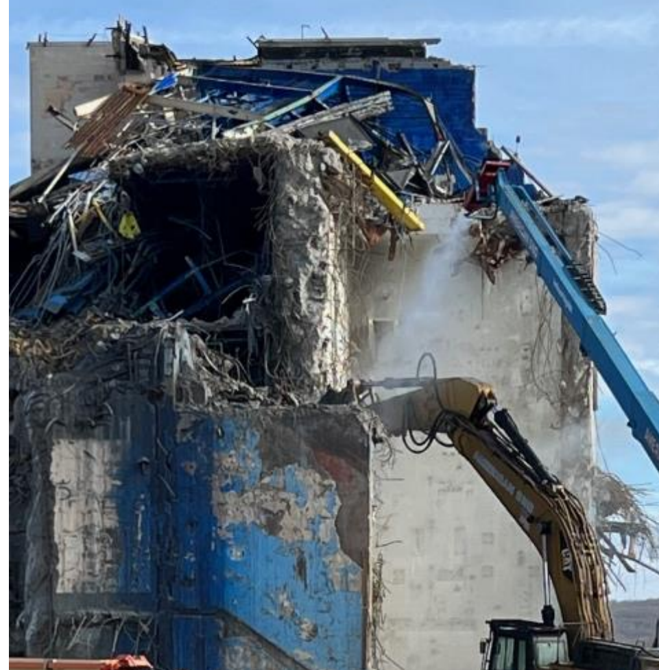
Deconstruction of Extraction Cell #1 north wall