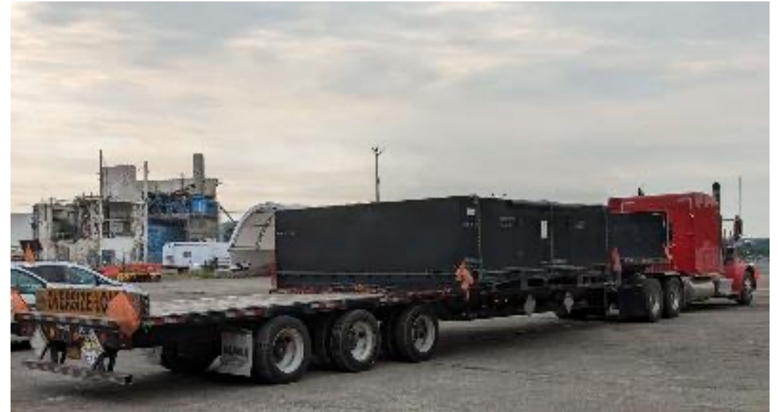
Waste Tank Farm Pumps