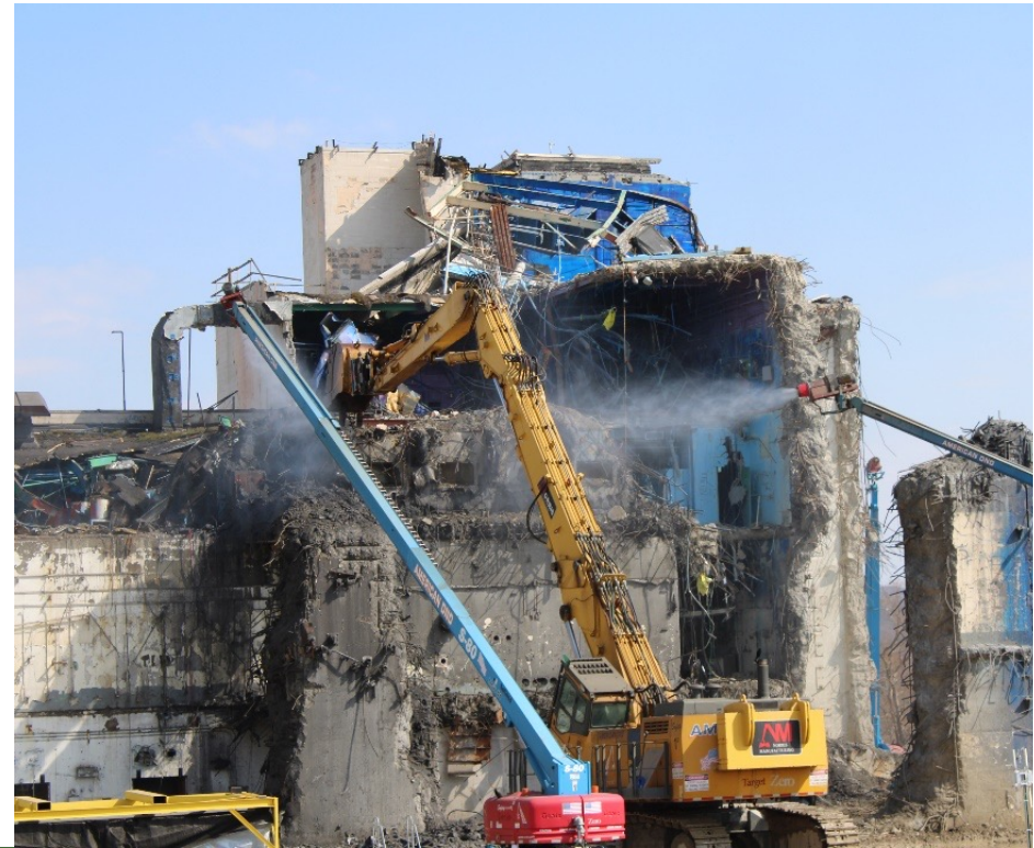
Clearing debris from Sample Storage Cell