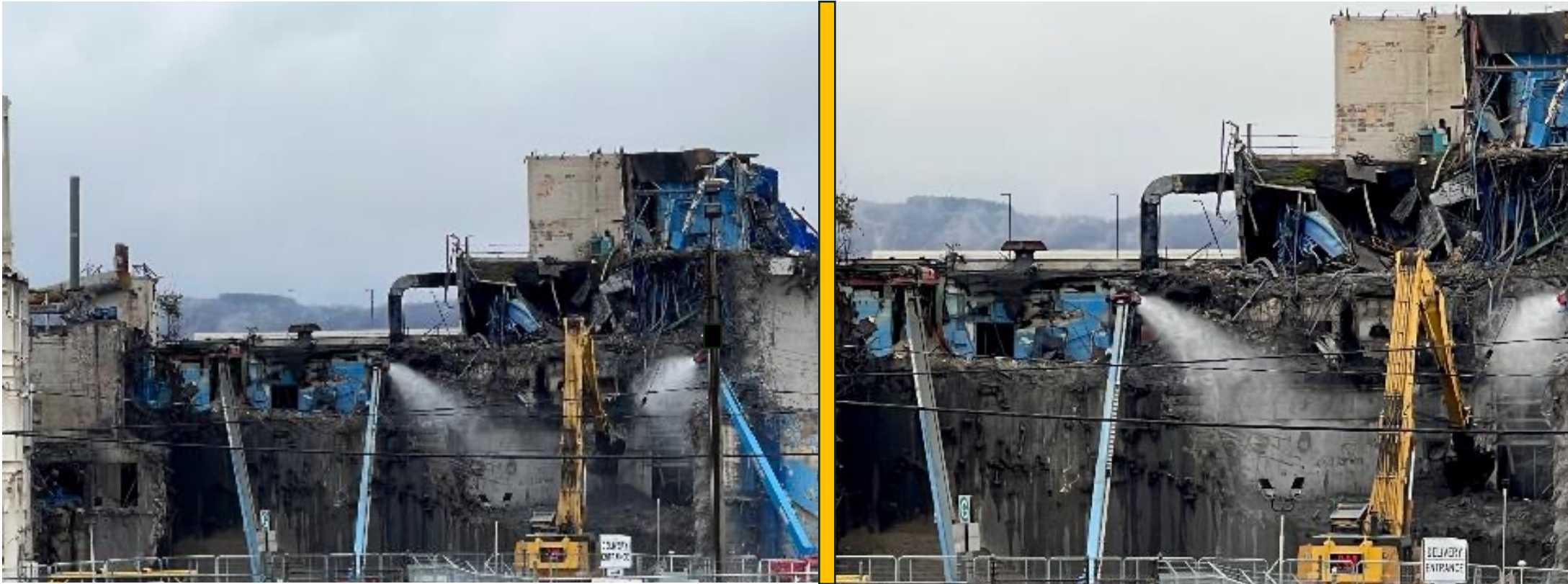
Hot Cell deconstruction