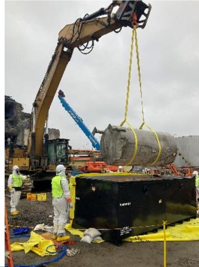
Liquid Waste Cell tanks removed, and one being loaded