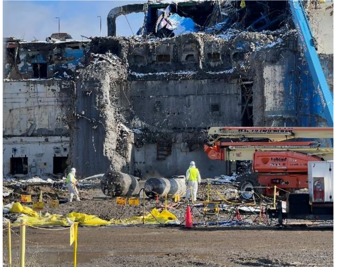
Liquid Waste Cell Tank 3D-2 and 7D-14 removed from Main Plant and prepared for loading