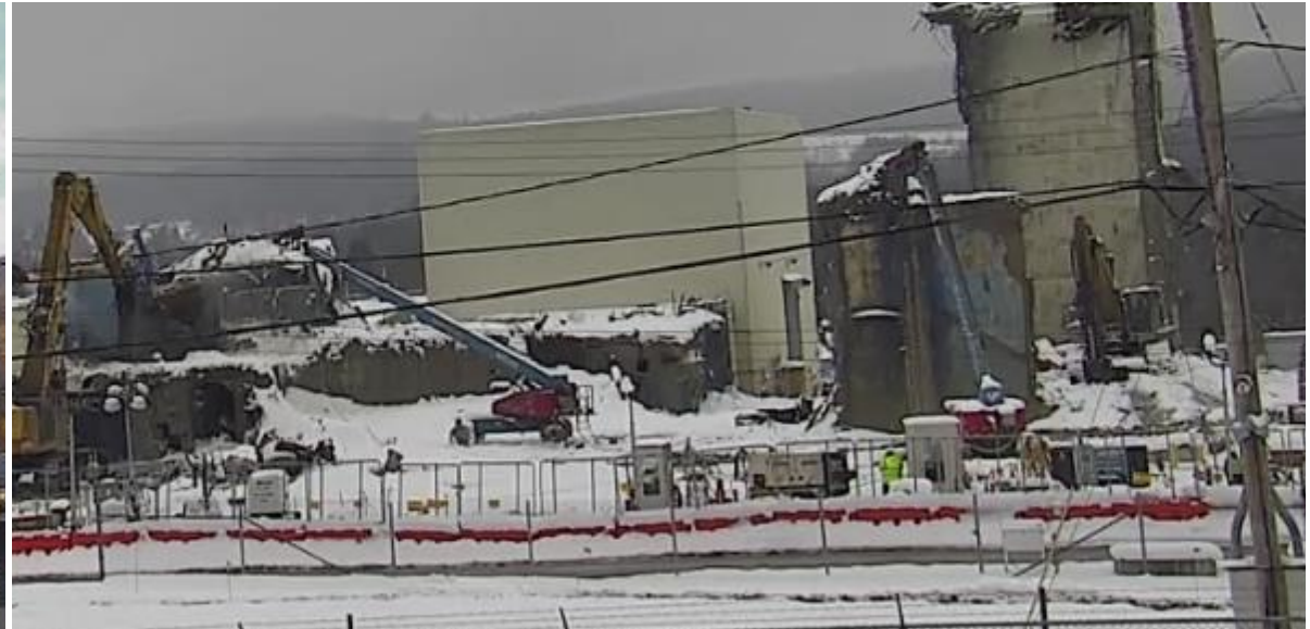
Main Plant west wall (December 2024)