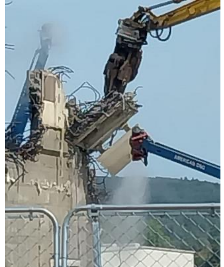
CMR Shield Door Removal