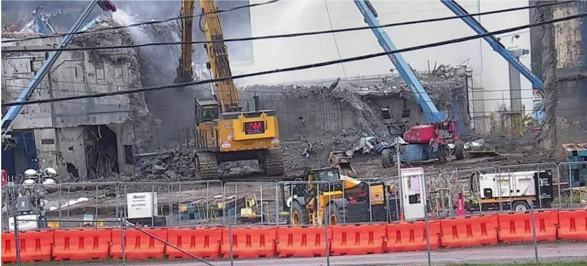
Process Mechanical Cell East Wall Deconstruction