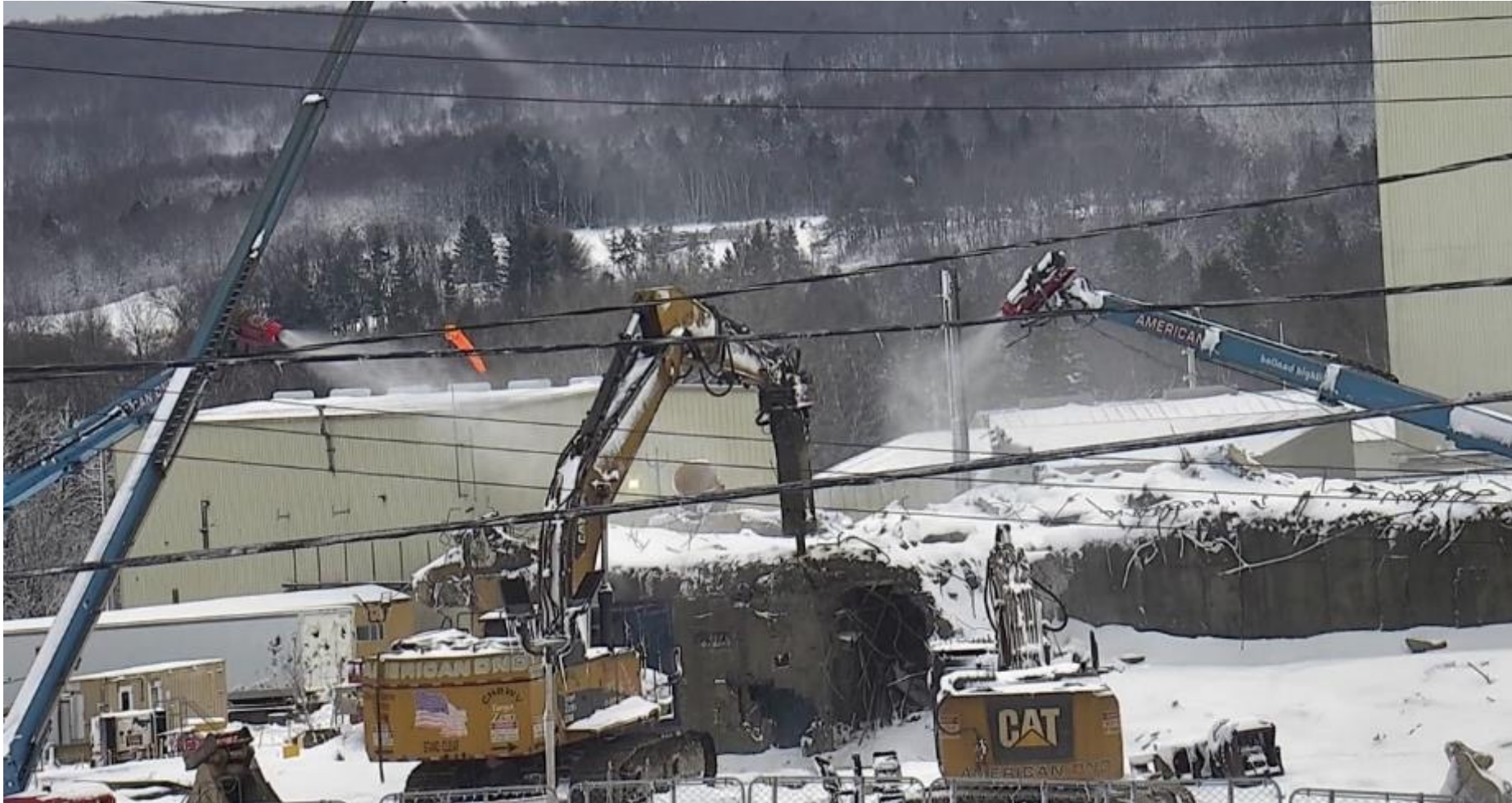
Process Mechanical Crane Room Floor Deconstruction