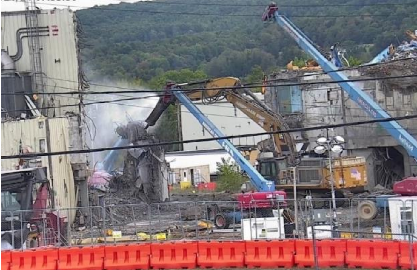
EDR to Vit Tunnel Deconstruction