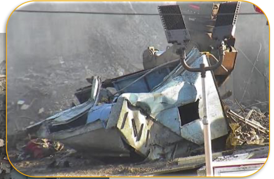
Removal of the Vent Supply Room Supplied Air Plenum