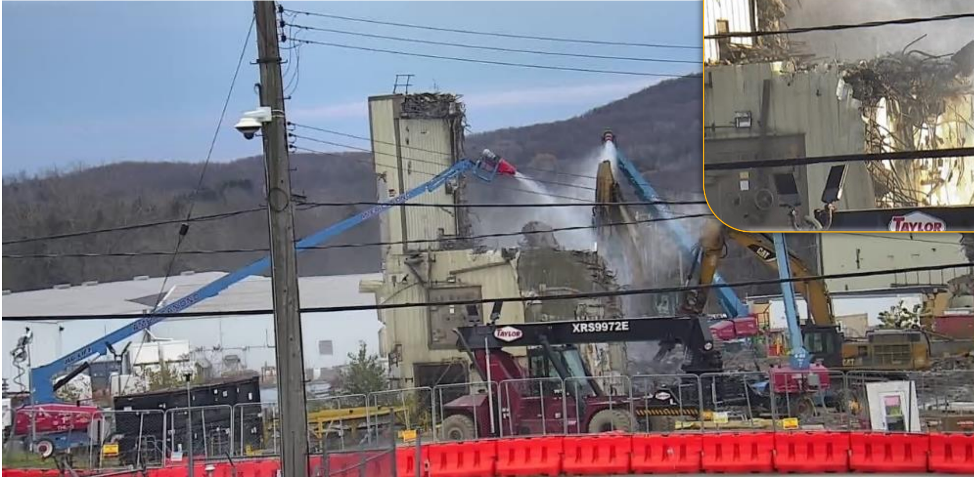
Vitrification Facility Bay 18 Deconstruction