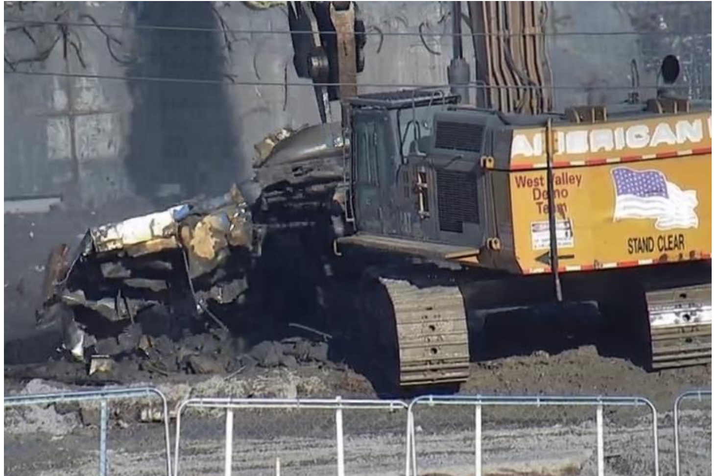
Process Mechanical Cell Liner Removal