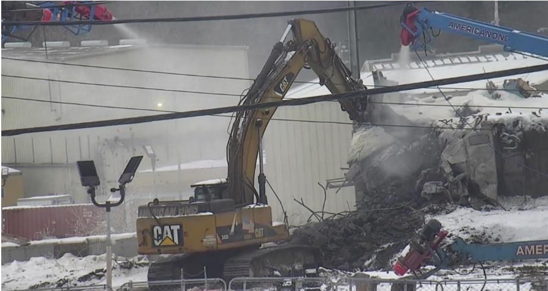
Process Mechanical Cell North Wall