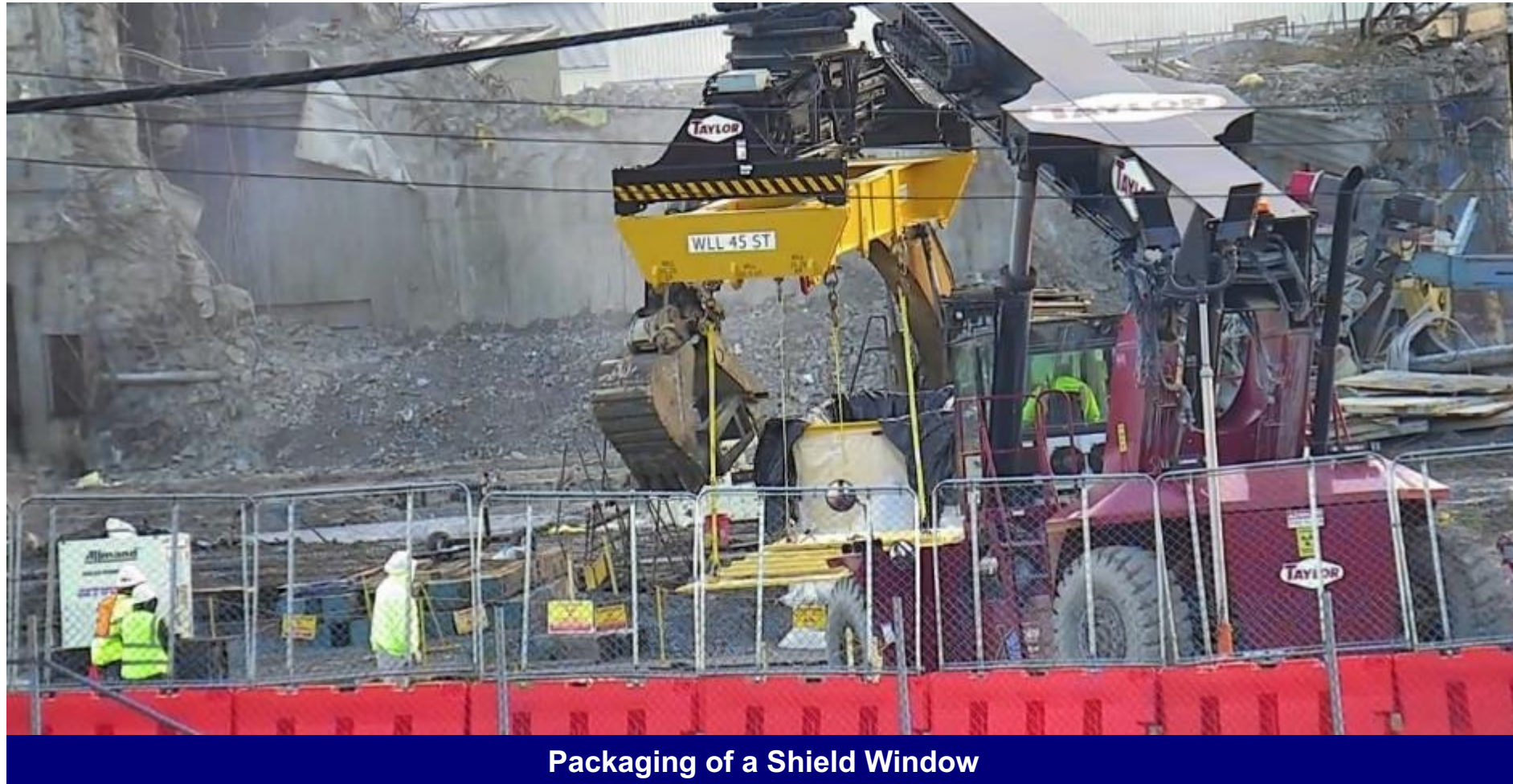
Packaging of a Shield Window