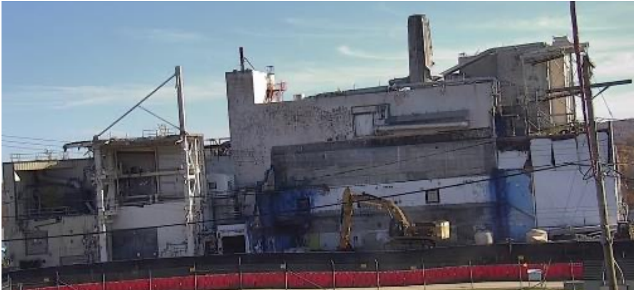
Main Plant west wall before deconstruction (June 2022)