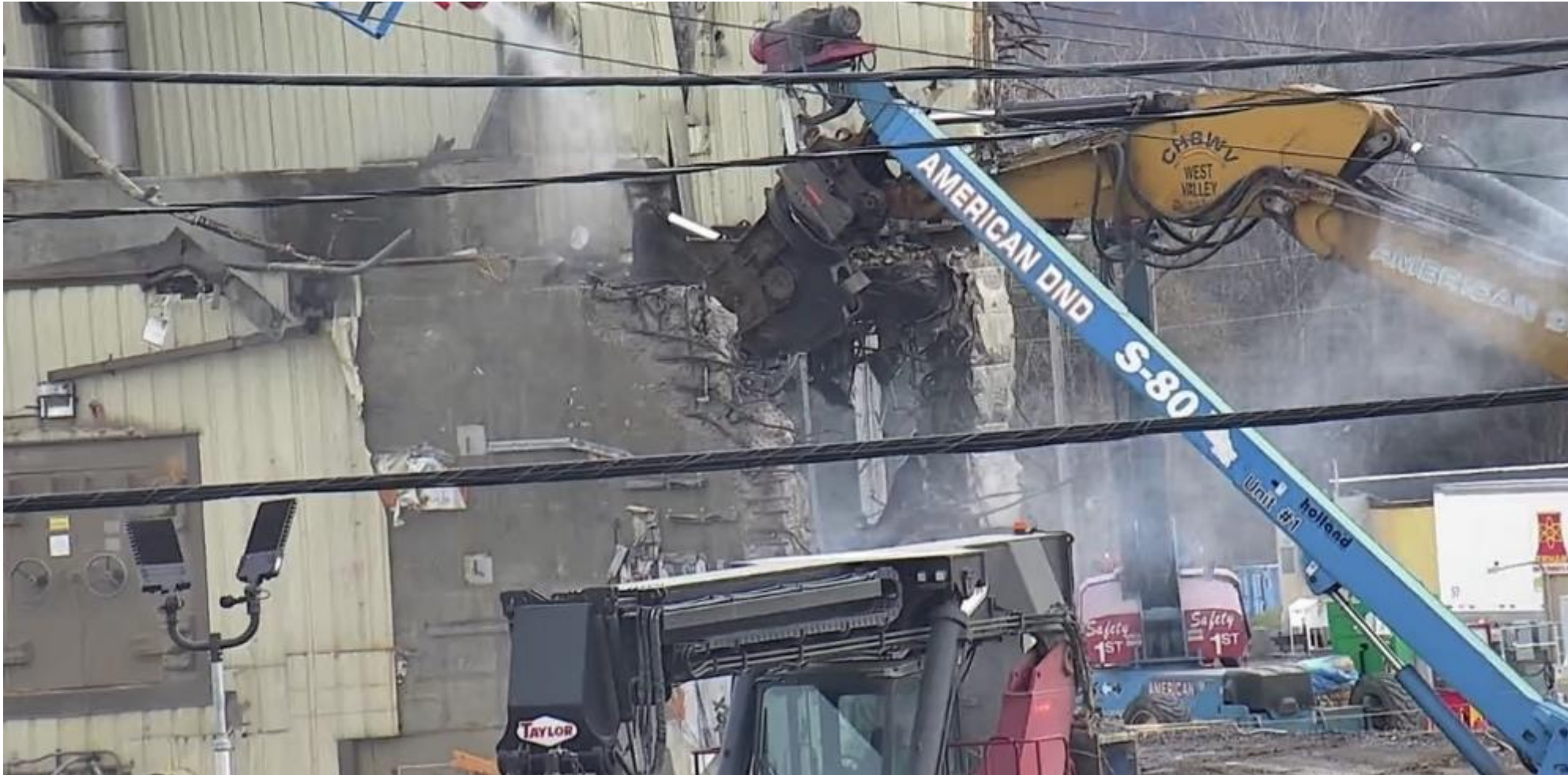
Bay 18 - Vitrification Facility Utility Room Deconstruction