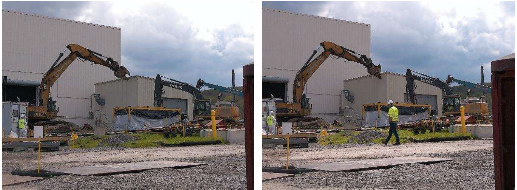
“First Bite” on the demolition of the RVU Building