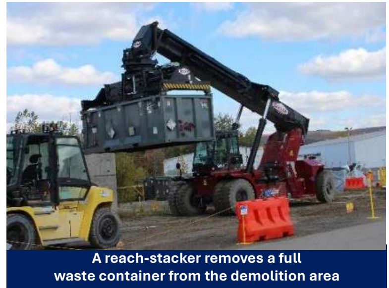
A reach-stacker removes a full waste container from the demolition area