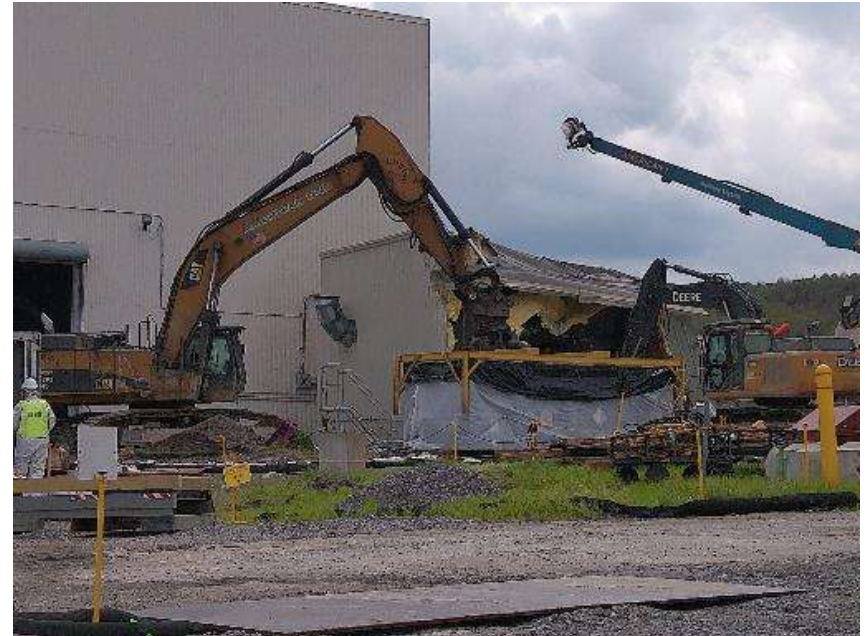
Demolition of RVU Building