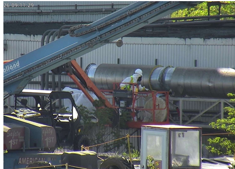
Workers safely remove large ventilation piping from Fuel Receiving & Storage Facility (demolition preparations)