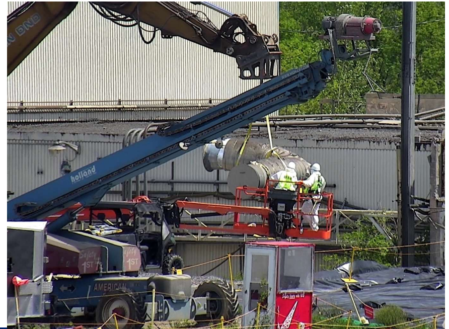
Excavator operator and field workers use teamwork to safely lift large ventilation piping