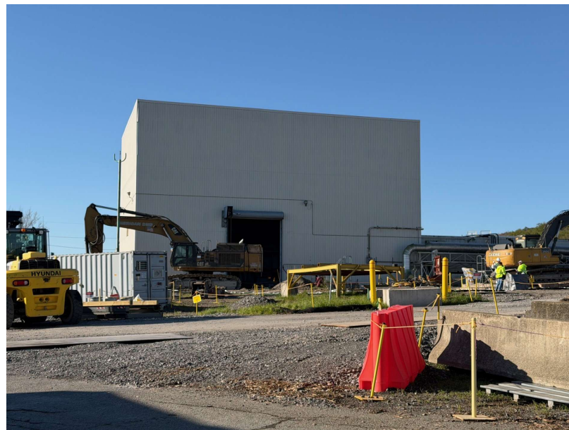
Before and After RVU Building Demolition